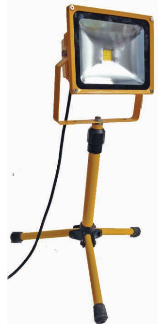
3-5' Tripod unit